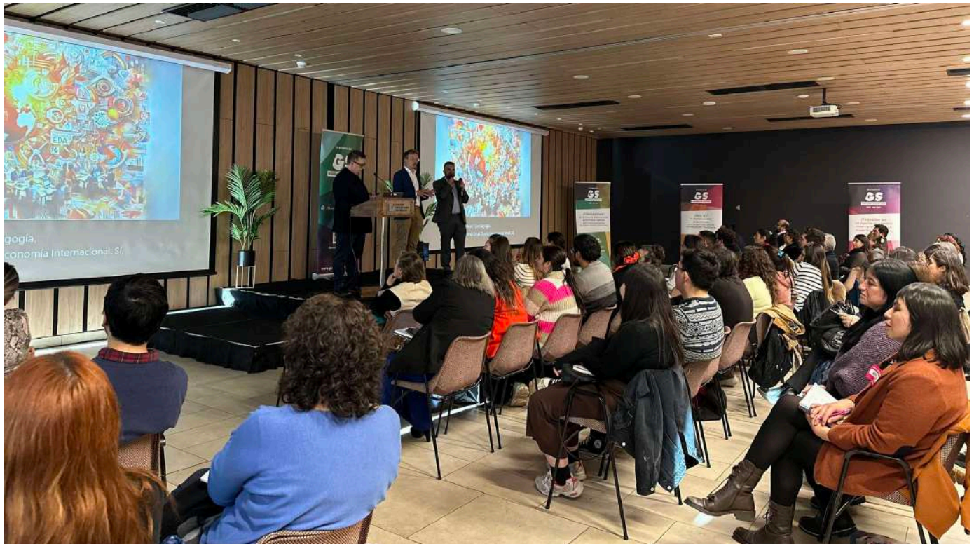
Thursday's seminar for teachers.

Our work trip was wonderfully fruitful, and we got to see the environments in which different classes of higher education operate. At the campus of the Universidad de Ciencias de la Educación (UMCE), the auditorium was cold and damp as the autumnal outdoor and indoor temperatures were quite equal, but the reception and the atmosphere were wonderfully warm. Similarly warm was the atmosphere at the Colegio de Ingenieros, but the premises were more modern. This, according to our local colleagues, was representative of the still existing class system in Chile. One could really feel the level of appreciation, especially in the UMCE.