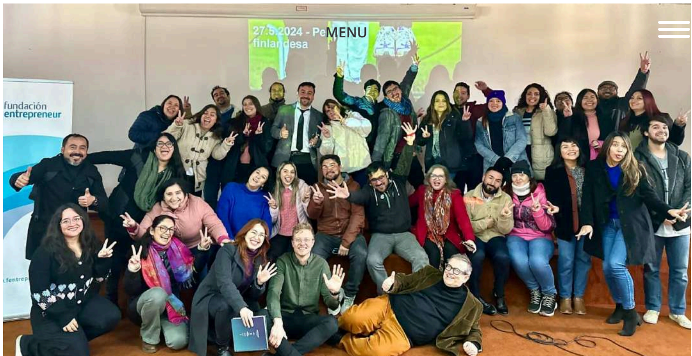
The public school teachers taking part in seminars on Monday, Tuesday and Wednesday.